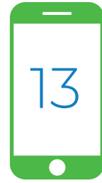
Ages 8+ hours spent online